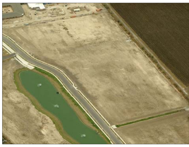
Figure 1: Pre-Construction Birds Eye View

The hospital sits on a several hundred thousand square foot tract of land with no adjacent buildings. There is a fairly large retaining pond across the street. A birds-eye view of the site before the facility was built and a plan view of after the facility was built can be seen in the Figures 1 and 2 below, taken from the map function of bing.com.