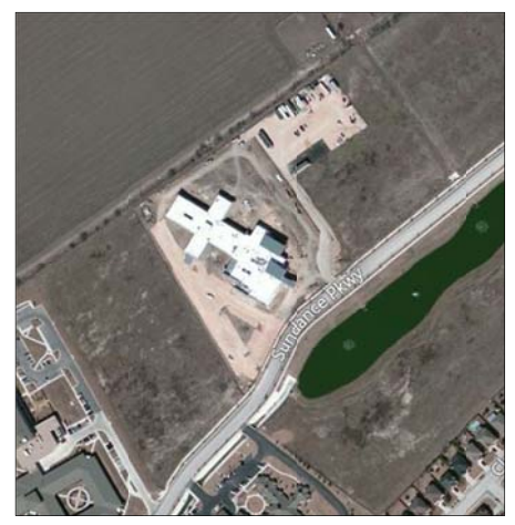
Figure 2: Post-Construction Plan View